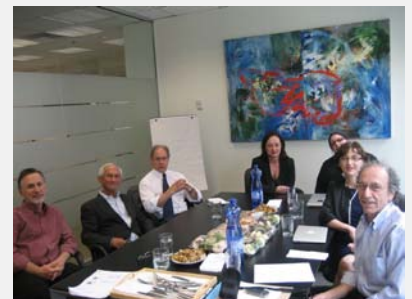
A Meeting of Info-Cult's Board of Directors.