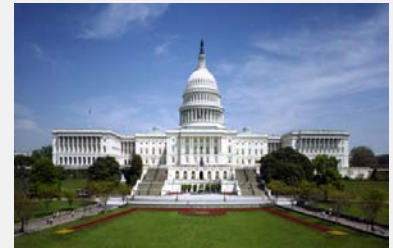
International ICOSA Conference, Washington, DC