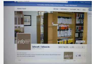
Info-Cult on Facebook

http://infosect.freeshell.org/infocult/Options_EN.html